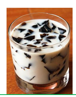
BoBo Tea w/Grass Jelly $3.50