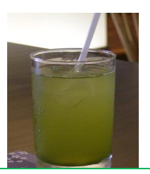
Ice Green Tea w/Honey $2.50