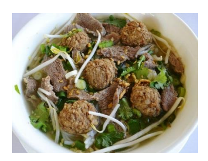
S5. Beef & Meatball Noodle Soup $9.95