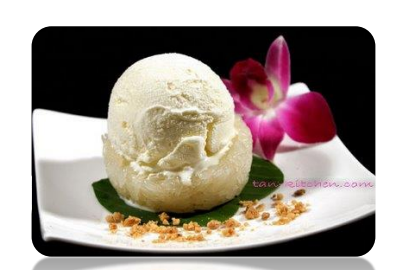
Homemade coconut ice cream with sticky rice $4.50