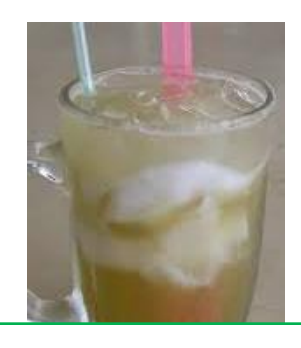
Coconut Juice with Pulp $2.75