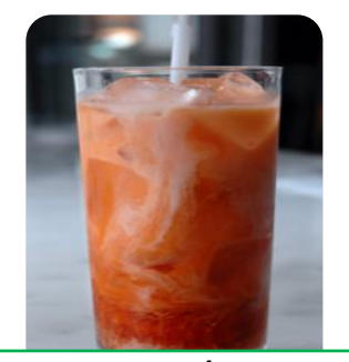
Thai Tea/Coffee $2.75