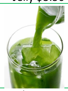
Matcha Mint Ice Green Tea $2.75