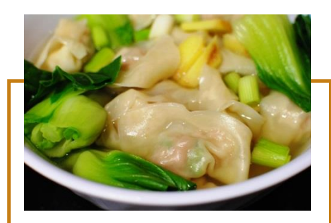
S3. Wonton Vegetable Soup Soup prepared with wontons (chicken filling) and vegetables in a clear chicken broth No Noodle With Noodle $7.95 $8.95

Choices of Meat Chicken Shrimp Seafood $8.95 $9.95 $10.95 Served in Hot Pot