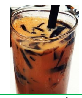
Thai Tea w/Grass Jelly $3.50